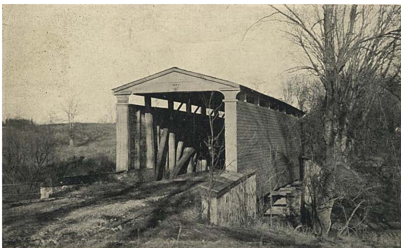
McCays Bridge, Near Boothwyn, Built 1852.